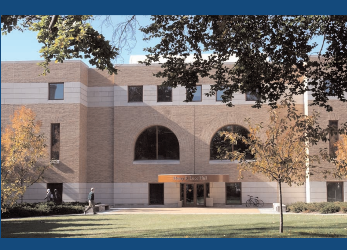
BULLETIN OF YALE UNIVERSITY Series 102 Number 15 September 10, 2006