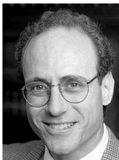
Donald P. Green