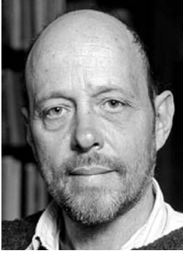
James Scott, Director of the Program in Agrarian Studies

The Program in Agrarian Studies is an experimental, interdisciplinary initiative involving faculty and graduate students from anthropology, history, political science, sociology, economics, international relations, the Law School, and the School of Forestry & Environmental Studies. The aim is to reinvigorate the analysis of agrarian issues with the fresh air of popular knowledge about lived experience — e.g., poverty, subsistence, cultivation, ecology, justice, art, custom, law, property, ritual life, cooperation, and state action. The interdisciplinary premise of the program is that the study of the Third World must never be separated from the study of the West, nor the humanities separated from the social