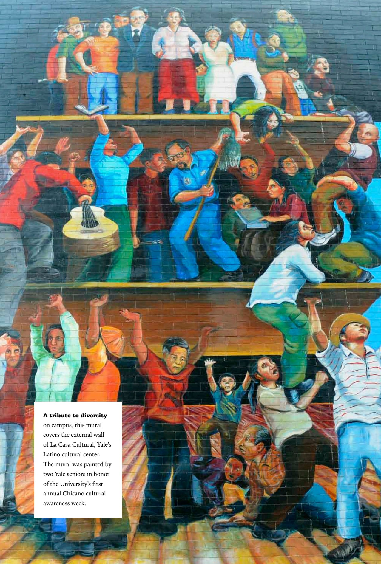
A tribute to diversity on campus, this mural covers the external wall of La Casa Cultural, Yale's Latino cultural center. The mural was painted by two Yale seniors in honor of the University's first annual Chicano cultural awareness week.