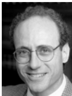
Donald P. Green